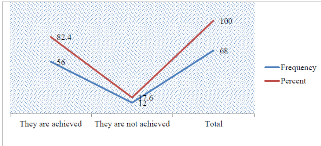
Figure .1.1 Whether objectives were achieved